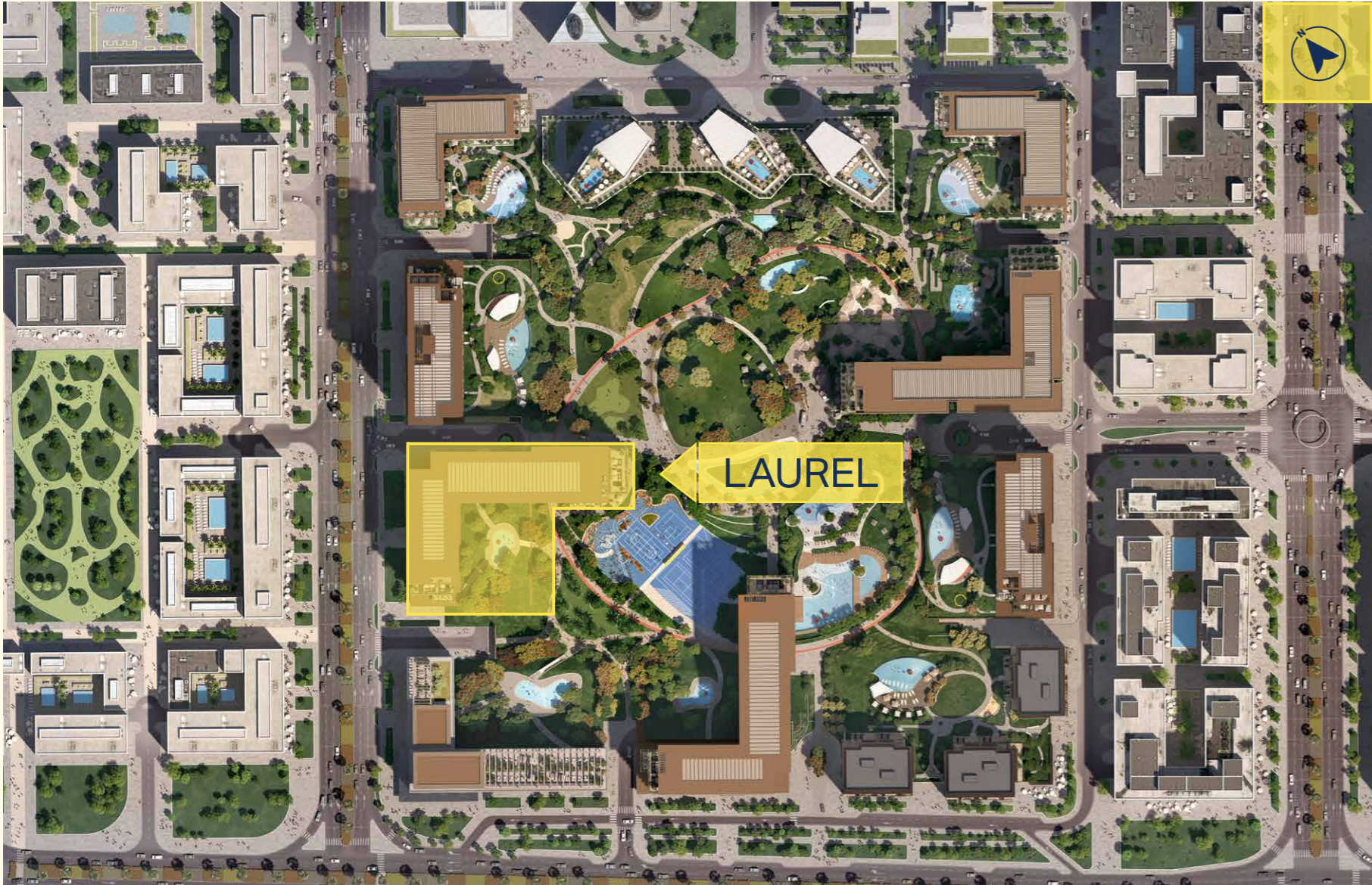
LAUREL FLOOR PLANS